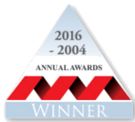
M&A Advisor Awards

FT Partners has been recognized as Investment Banking Firm of the Year and regularly achieves Merger and Financing Deal of the Year recognition