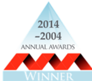
M&A Advisor Awards

FT Partners has been recognized as Investment Banking Firm of the Year and regularly achieves Merger and Financing Deal of the Year recognition